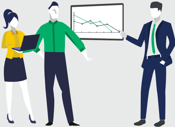
CHART THE PATH TO NET ZERO

Our Advisory Team is composed of veteran ESG, impact investing and technology experts who advise our customers strategically. By leveraging our technology and industry knowledge, we are able to conduct comprehensive carbon footprint assessments and develop our clients' internal capacities.